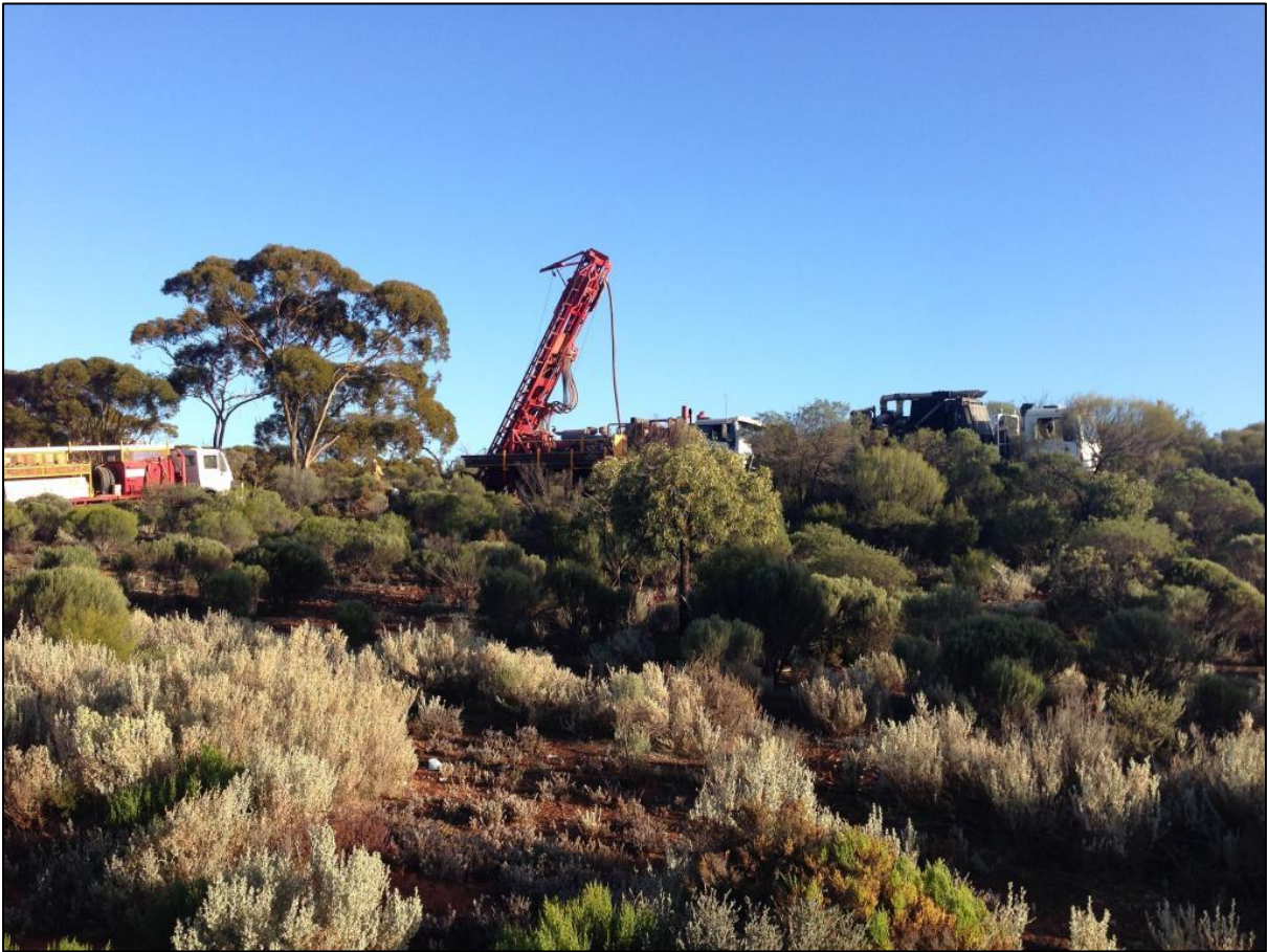
Figure 3: RC rig in operation at Target 18 at the Company's Zuleika project.